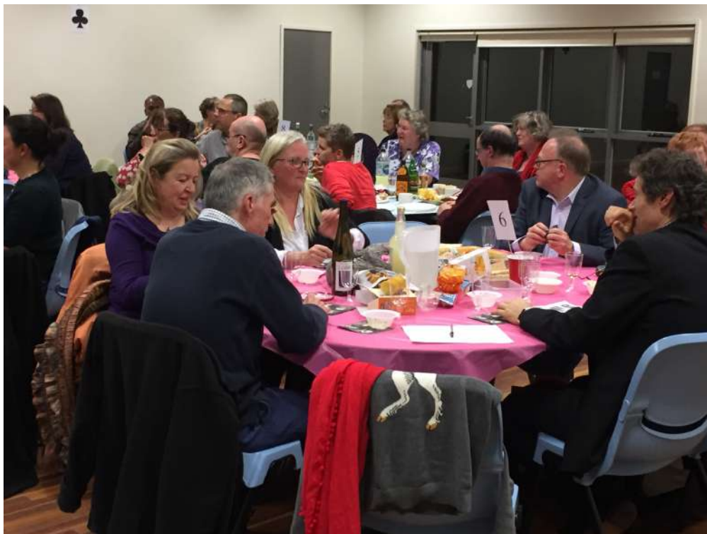
Trivia Night - The Team's table in the foreground – a picture of concentration!