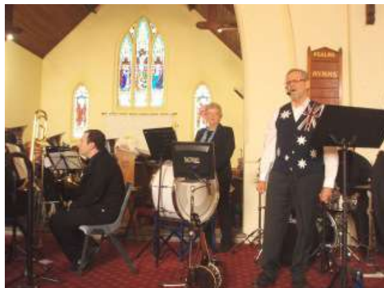
Oakleigh Brass performing for the Oakleigh Anglican Church 160 th (left) and combining with Liddiard performers (right)