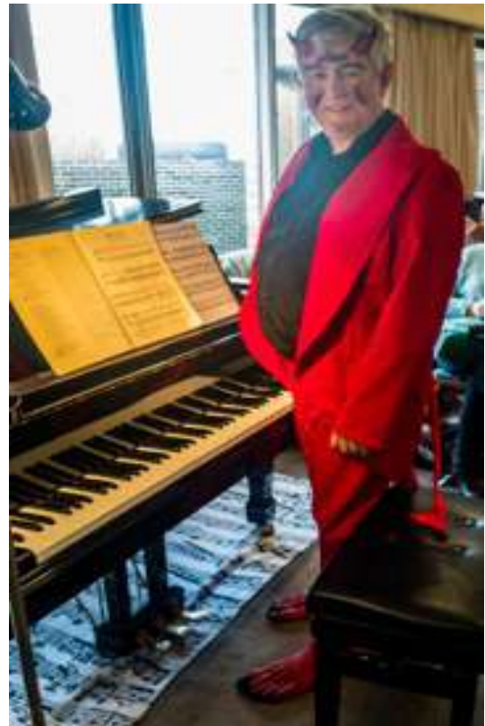
Photo: Mephistopheles poised at the piano