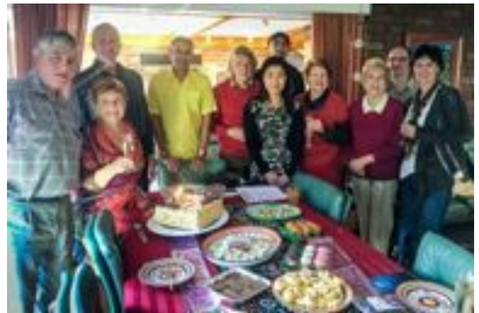
Above: Members at the celebration on 11 April