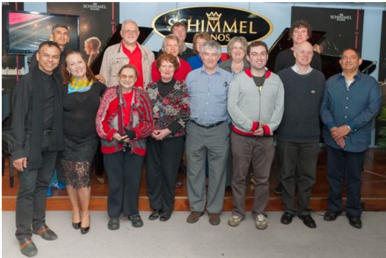
The happy troupe at Bernies Music Land.

Thank you to those members who hosted us in their homes this year. The occasion pictured above was held at Bernies Music Land, where we were delighted to test-drive one of the latest Schimmel model pianos.